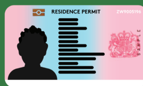
Biometric Immigration Document