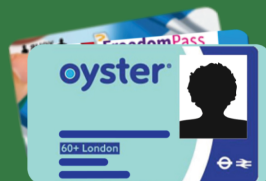
60+ Oyster photocard or a Freedom Pass