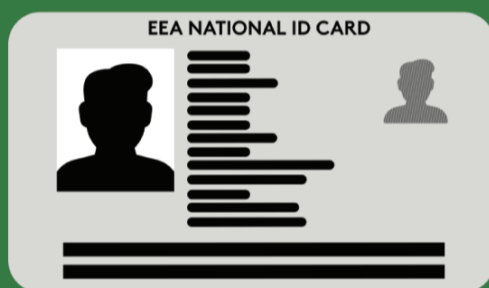
National identity card issued by an EEA state